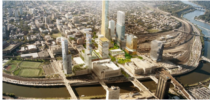
Public Realm Plan