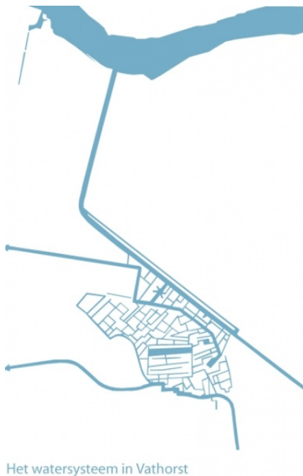
Het watersysteem in Vathorst

The site Vathorst is situated on the east side of the A1 highway that forms the border to the last suburban extensions of the city of Amersfoort. West 8 together with Kuiper Compagnons made a masterplan for this Vinex site. The plan contains 11000 dwellings, 90 hectare of commercial, industrial and office programs and its required public facilities.